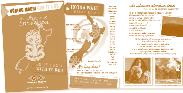
Te Pukapuka hōu mō Te Wiki o te reo Māori

kei te taurite ngā kōrero whakatairanga, ā, ka māia ake tā rātou whakamahi i ngā rauemi ki te tautoko i te whakamahi i te reo. Koinei i huri ai Te Taura Whiri i te Reo Māori ki te whakawhanaunga ki ngā whakahaere pērā ki ēnei: te Health Sponsorship Council, te Kāhui Tika Tangata, Te Kete Ipurangi, te Reo Irirangi Māori, Te Māngai Pāho, Whakaata Māori me TVNZ; he ōrite hoki ō rātou whāinga ki ō mātou. Ka tautoko anō hoki ēnei hononga i ngā kaupapa ā-motu pērā ki a Matariki me te Wiki o te Reo Māori.