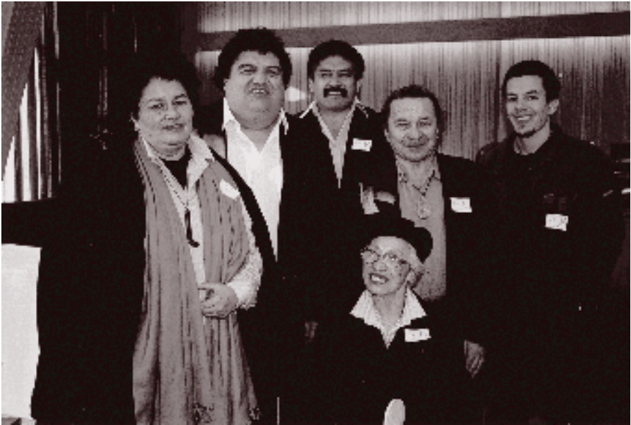
Te Minita o Ngā Take Māori me te Poari o Te Taura Whiri i te Reo Māori

Kia tutuki tēnei wawata, ko tā mātou mahi he āta whakaū kia noho tonu te arotahi o ā mātou mahi, mā te reo, me te reo, mō te reo.